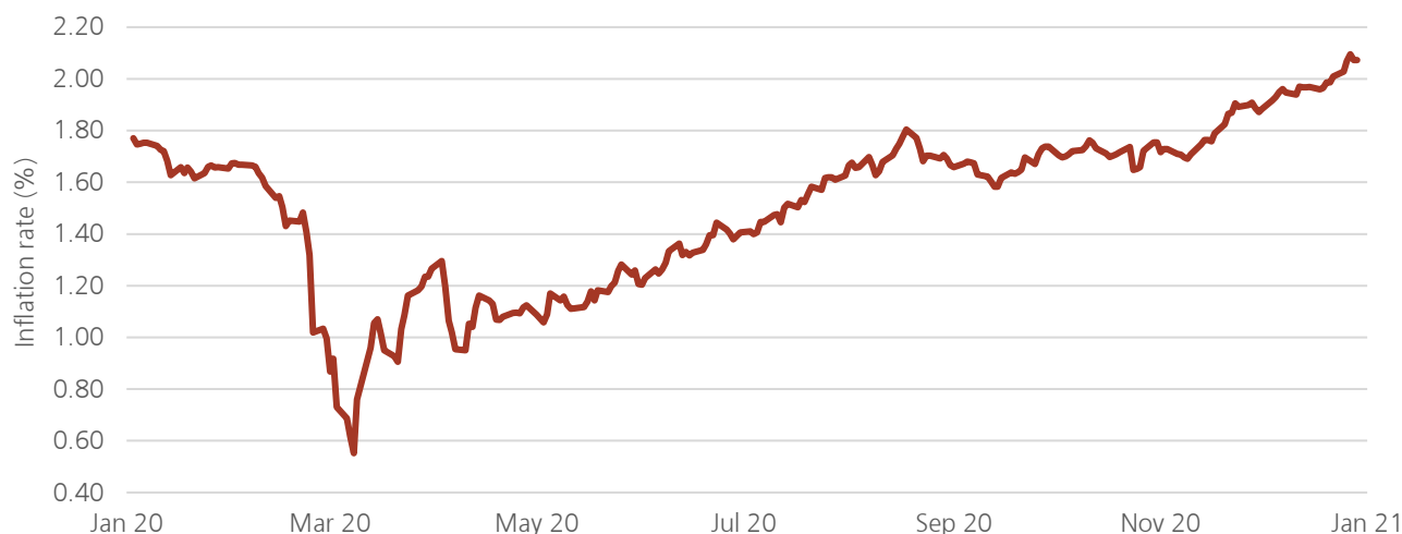
Chart 4 - US 10-year breakeven inflation rate