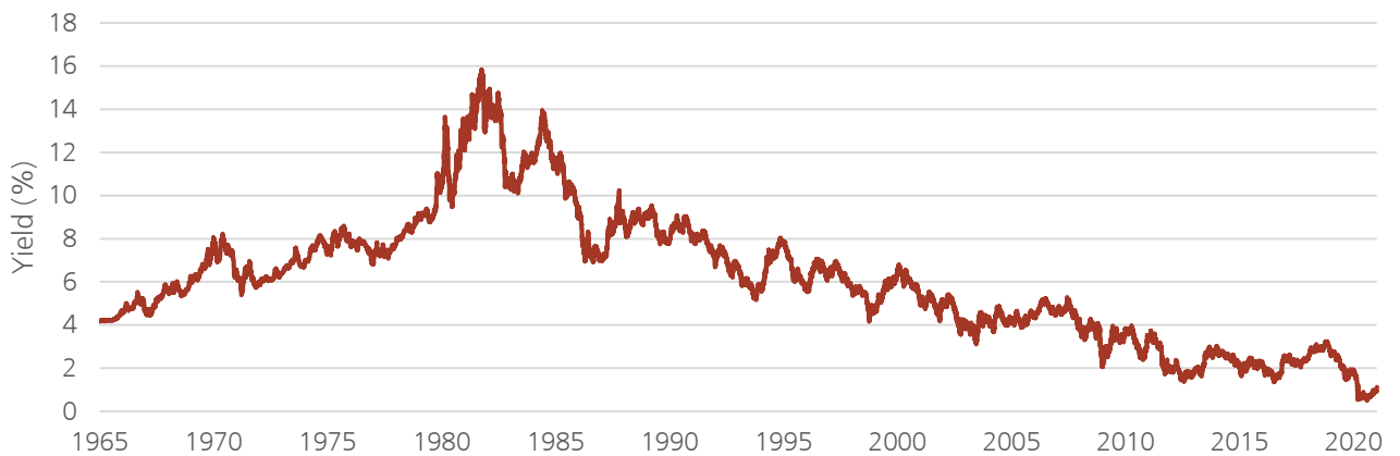
Chart 2 - US 10-year Treasury yield since 1965

Source: Bloomberg, as at 11 January 2021