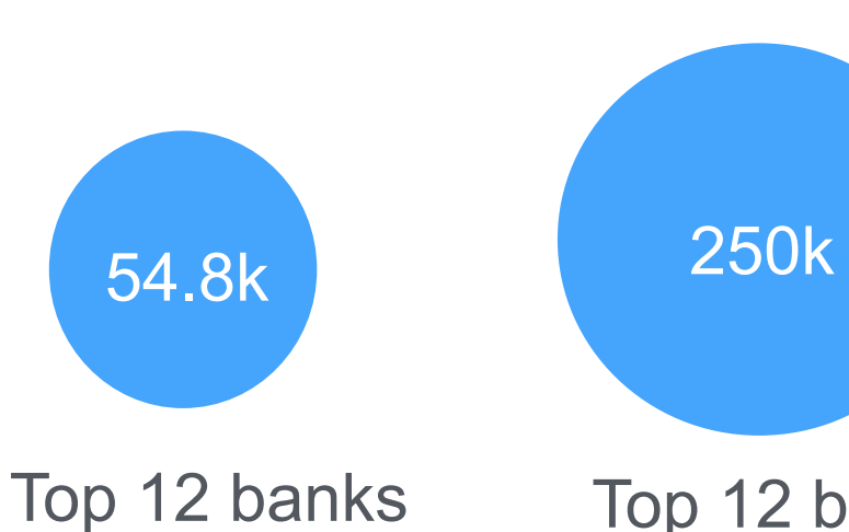
Top 12 banks exc. front office (est.)