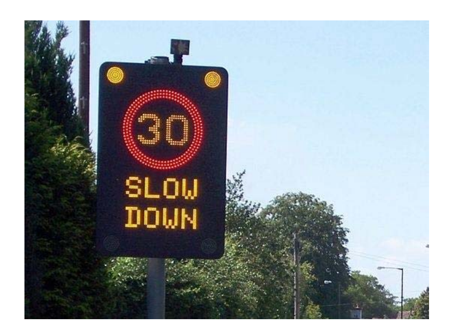
Warn employees BEFORE they breach