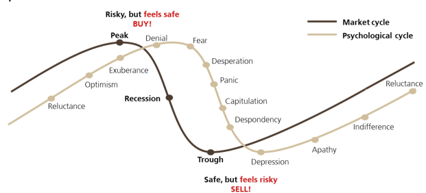
Fig. 3: Recency bias can lead us to chase performance

The hard way to learn about your risk tolerance is through experience. To quote Vernon Sanders Law, "Experience is a hard teacher, because she gives the test first, the lesson afterwards." Moments of extreme volatility and stress can help us find the limits of our tolerance for risk. Later, being reminded of our past reactions—with the full perspective of hindsight of how markets performed afterwards—can help us can context when the next pocket of volatility arrives.