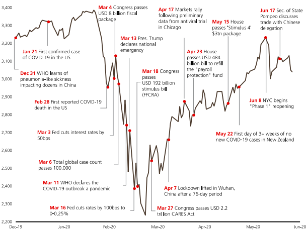
Fig. 1: 2020 has seen brutal market volatility

The COVID-19 pandemic has been a particularly stressful experience, combining significant financial uncertainty—including the fastest-ever bear market sell-off, and the sharpest bout of job losses in history—with a global public health crisis and significant social unrest.