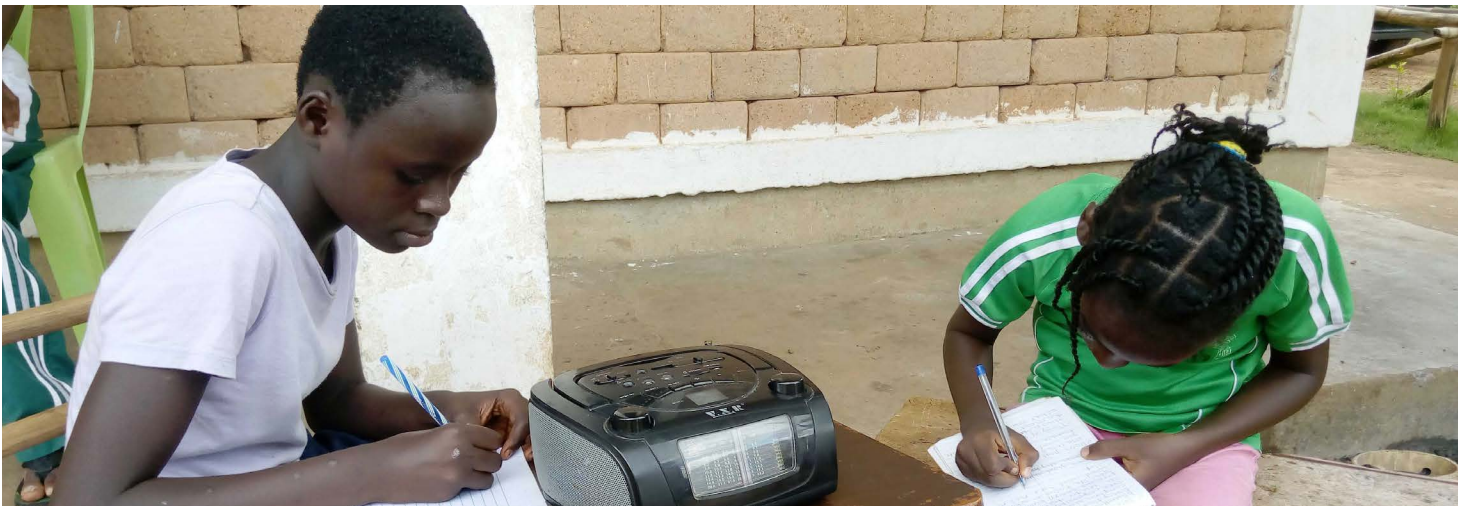
children learning by radio in Margibi County, Liberia