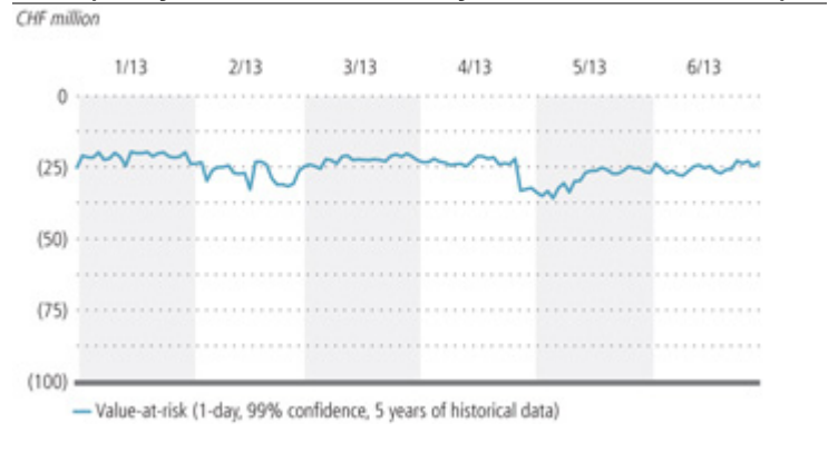
Chart 1: Group: development of backtesting value-at-risk<sup>1</sup> (1-day, 99% confidence, 5 years of historical data)

tions and any exceptional revenues on the profit side of the VaR distribution. In addition, all backtesting results are reported to senior business management, the Group Chief Risk Officer and the business divisions' chief risk officers. Backtesting exceptions are also reported to internal and external auditors and to the relevant regulators. The chart "Group: development of backtesting value-at-risk" shows the six months development of 1-day 99% VaR of the Group up to 30 June 2013. The histogram "Investment Bank and Corporate Center daily revenue distribution" shows the daily revenues distribution for the Investment Bank and Corporate Center for the last six months up to 30 June 2013.