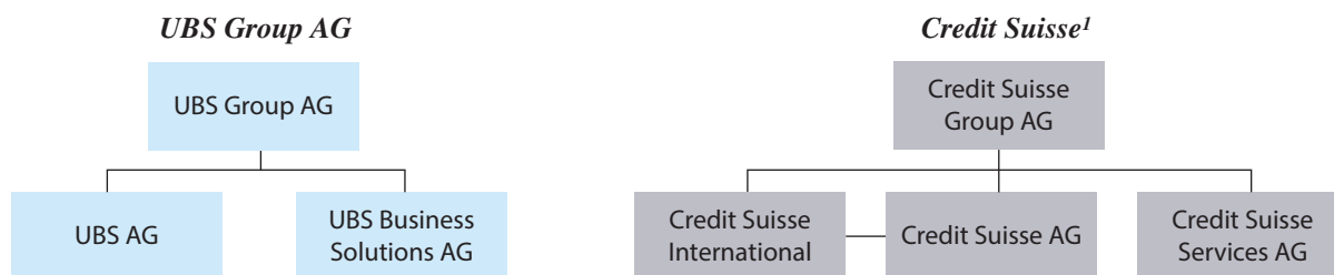
Immediately Following the Consummation of the Transaction 2