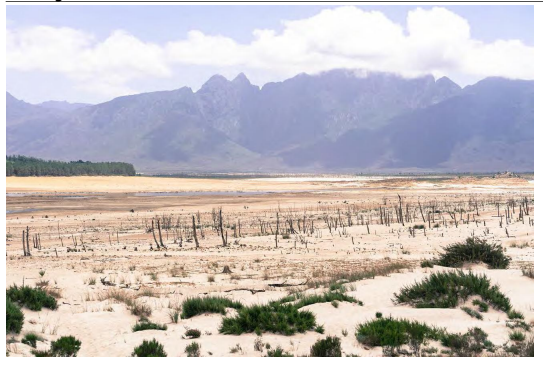
Fig. 2: Theewaterskloof Dam water levels, February 2018