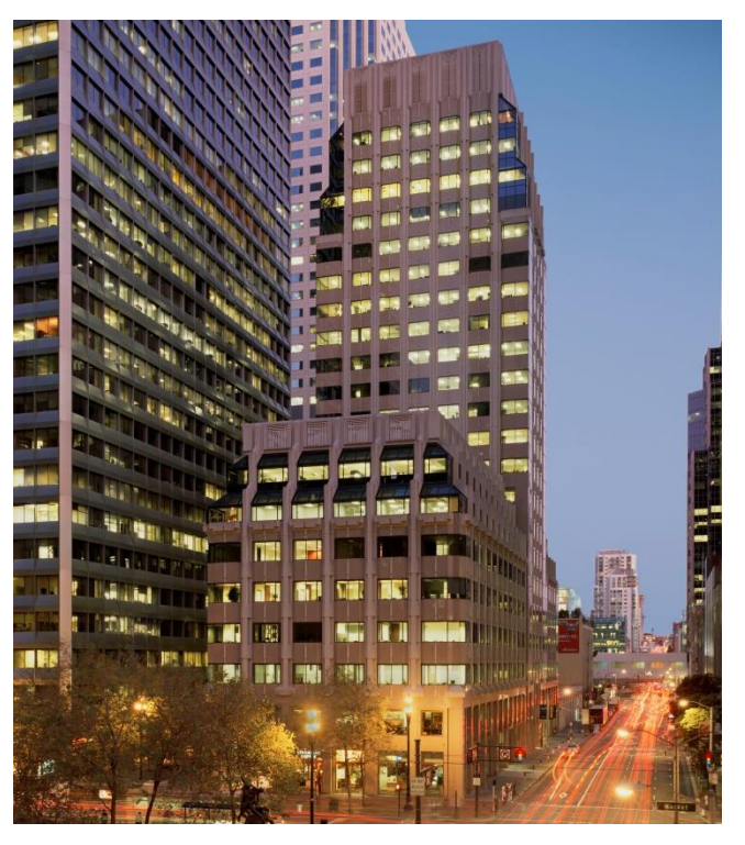
455 Market Street – San Francisco, California, USA

Health & wellbeing has become an increasingly important focus across the entire real estate industry. Although the energy and environmental components of buildings have received significant attention for over a decade, the social components are quickly becoming just as important. Through prioritizing health & wellbeing, we are not only further modernizing and enhancing the appeal of our buildings, we are also creating greater levels of trust among our occupants – particularly as people prepare to return to the office.