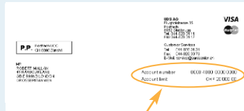
UBS Credit Card account number on your credit card statement